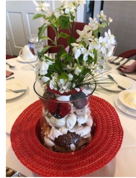
“Table centerpieces were made by our members using hats.”

This fundraiser not only brought our members together but also our neighbors and friends. We will use the money raised for our two - One Thousand dollar scholarships which we give to two Delaware Tech students studying Horticulture or a related field plus other community service projects, in which our club participates.