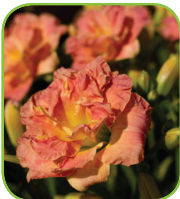
Lacy Daily Daylily