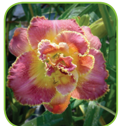
Unlock the Stars Daylily