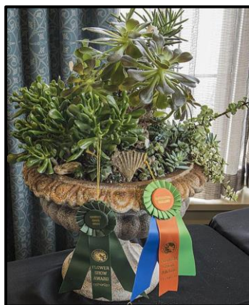
Awards of Design and Horticultural Excellence at Judges’ Council Standard Flower Show

In April and May , Environmental and Gardening Schools were held. Also in May, Federation members had an overnight and visit to NorthBay Environmental Camp, this State President’s