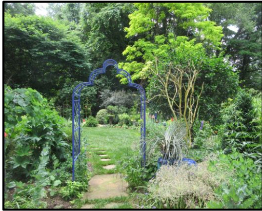
Elissa Steeves' Garden, Blacksburg, VA

NCAGC is on the move! Our members don't grow much moss under our toes—we are always travelling! This June NCA had two different adventures. NCA held a Bi-Refresher and visited Virginia and West Virginia. The first stop was